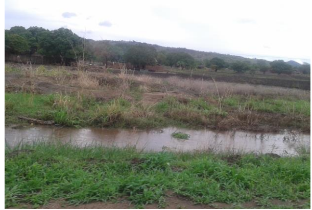
Figure 1: (Left) Tree nurseries raised by the community through Village Natural Resource Management Committee (VNRMC) with support from LEAD. Right: The degraded sites of Ulungwi river-the river supports livelihood of the people through irrigation, fishing and planting of bananas. It was affected by floods as per this February 5, 2015 photo.