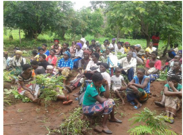
Figure 2: Left-part of participants for VNRMC training in governance, ecosystems services, climate change, natural resource management and specifically tree management. Right: A cross-section of people who participated in 2015 Changali Tree Planting launch