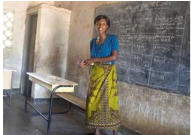
Figure 4: Top-participants Conservation Agriculture & Poultry farming sensitization meeting. Below-left: A representative of District Agriculture Office officially opening the function. Below-Right: Extension staff explaining the beneficiary identification process.